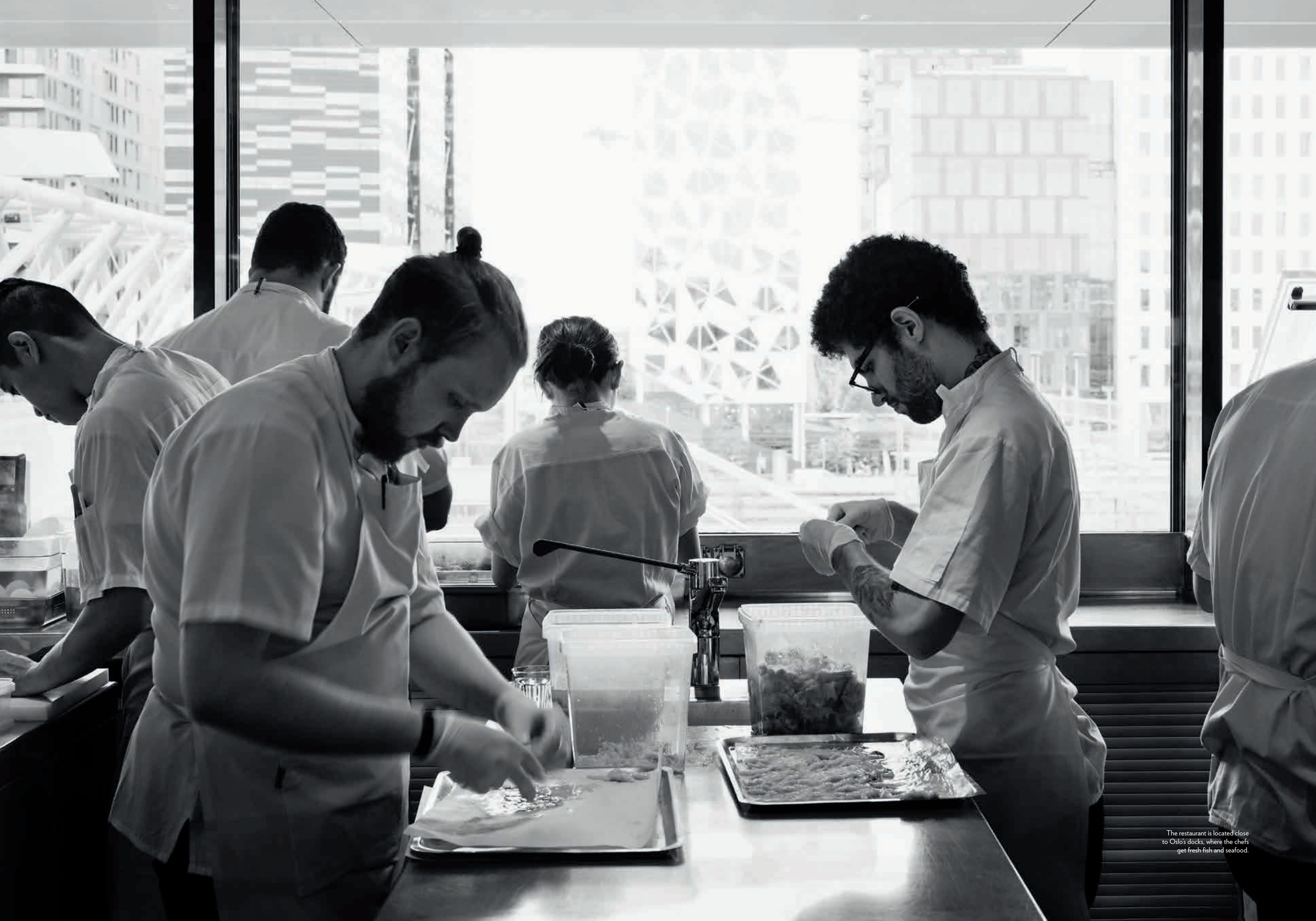
The restaurant is located close to Oslo's docks, where the chefs get fresh fish and seafood.