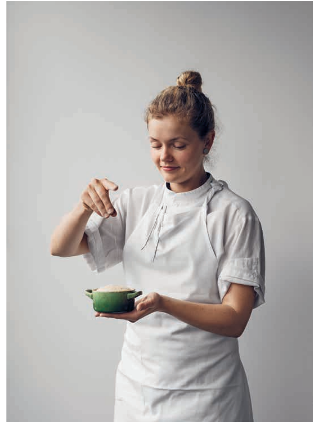
Aesthetically, Maaemo plays with "lines, shape and light". Bolon Graphic; Etch (left image) provides the perfect complement to this.